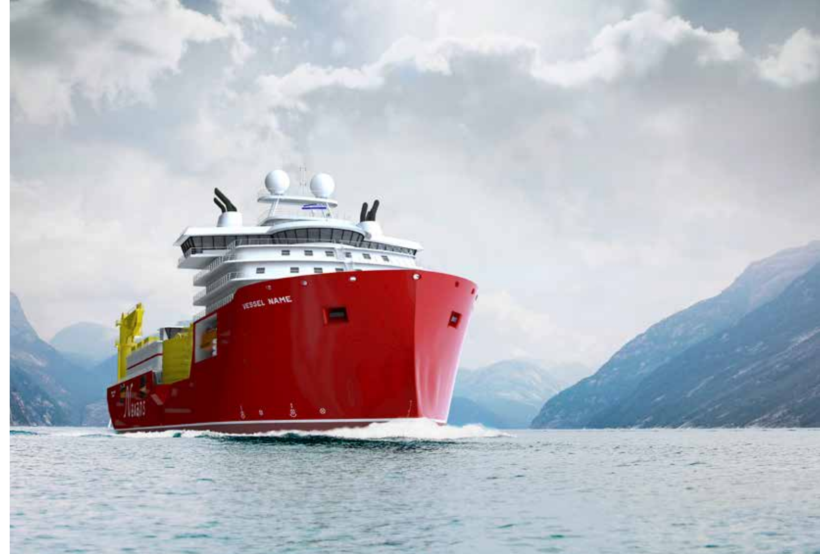
Nexans has invested in a new cable-laying vessel with expected delivery in 2020.

The Nexans CAPJET trenching system has buried more than 8,000 km of cables, umbilicals