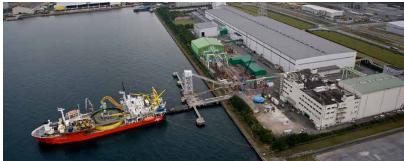
Production facility in Futtsu, Japan