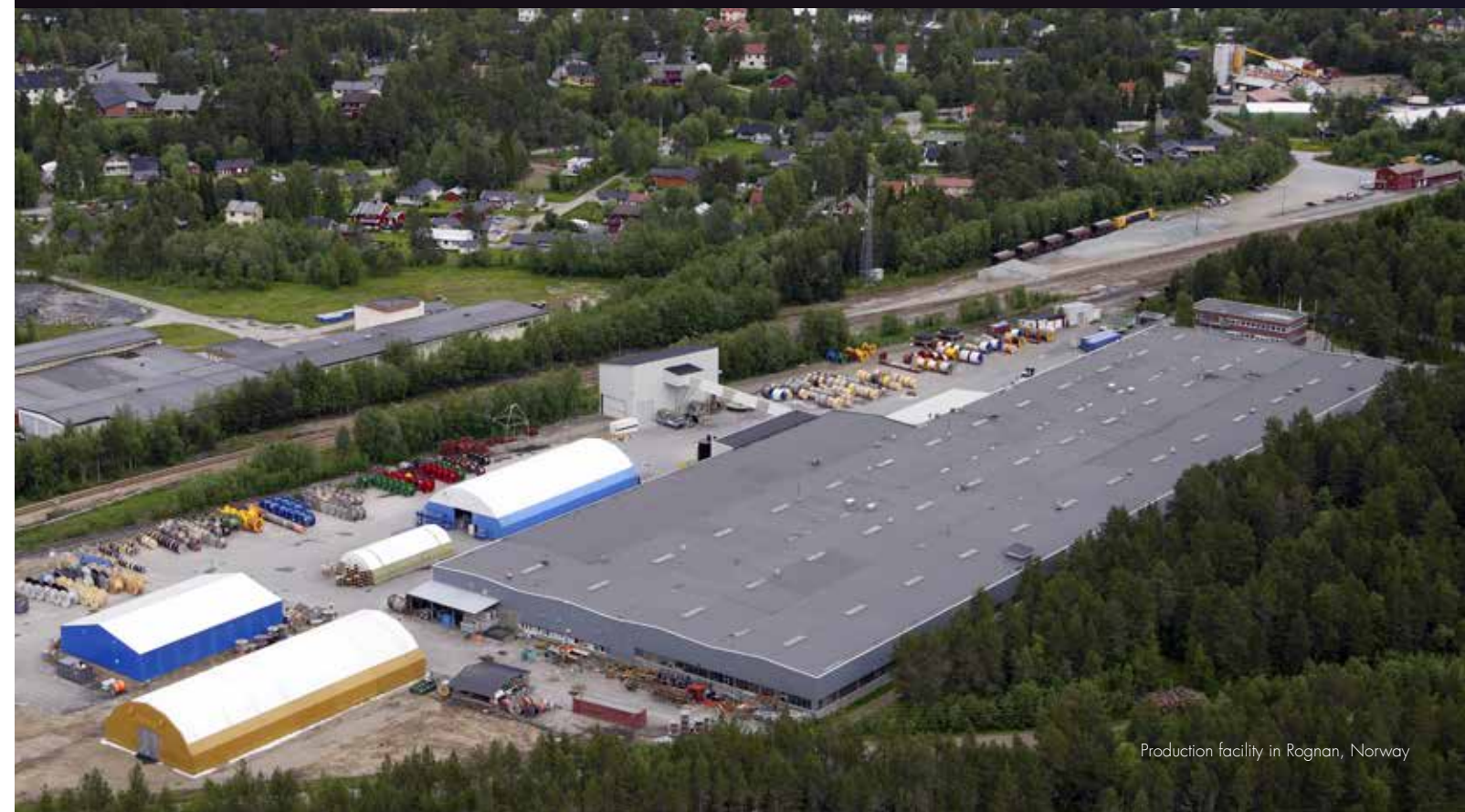
Production facility in Rognan, Norway