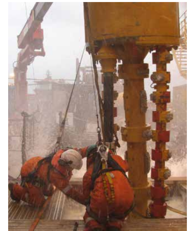
Installation of a subsea junction box

The first phase of the Shah Deniz DEH cables for BP's field in Azerbaijan was delivered in 2014. When in operation the Shah Deniz field will be the world's largest and most complex DEH installation with 10 parallel heated pipelines (over 120 km in total) connected to the platform.