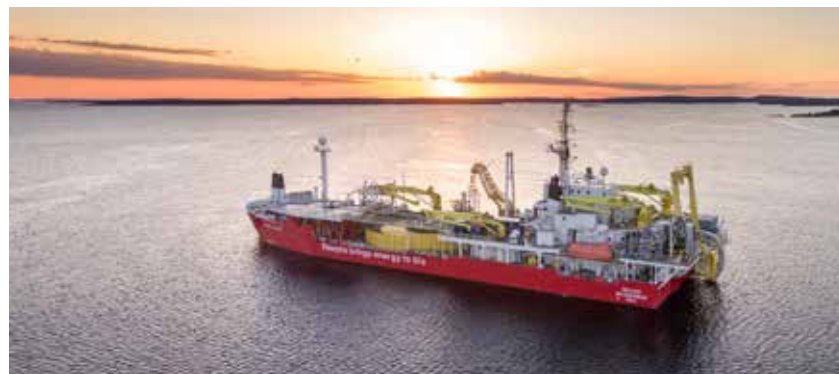
C/S Nexans Skagerrak

As critical elements in any submarine transmission system, it is important that cables and umbilicals are installed properly. With references from more than 1,500 submarine installations, Nexans has the knowledge and equipment to ensure safe installation and protection services.