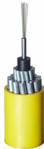
The URC-1 is used for systems with lengths up to 500 km