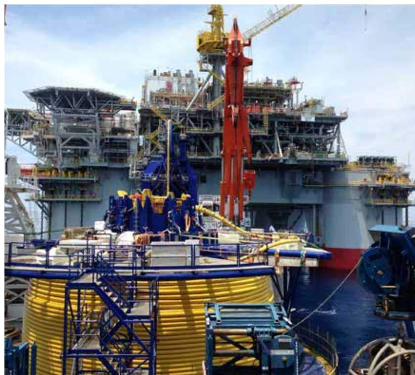
The Jack & St. Malo power umbilicals were installed in August 2014 on Chevron's oil and gas fields in the Gulf of Mexico. With a water depth of about 2,400 meters, it represents the deepest installation Nexans has ever developed and delivered power umbilicals for.

processing equipment. Nexans has pushed the technology envelope to realize complex power umbilicals, which combine high voltage cables with the functions traditionally provided by electro/hydraulic umbilicals. This technology has been supplied to BP's King project, Statoil's Tyrihans project and Chevron's Jack & St.Malo project.