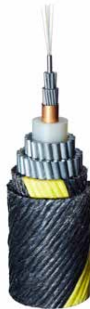
The ROC-2 is used for systems up to 10,000 km long and down to 8,000 m water depth

clamps, J-tube seals, elastomer protection sleeves, flexible steel hose, cable coiling frames, and more. For cable network and repair, we supply branching units, wet-mateable connectors, ROPA boxes, cable joints for submarine, topside and onshore use, and terminations for wet-mateable connectors and optical distribution frames (ODFs).