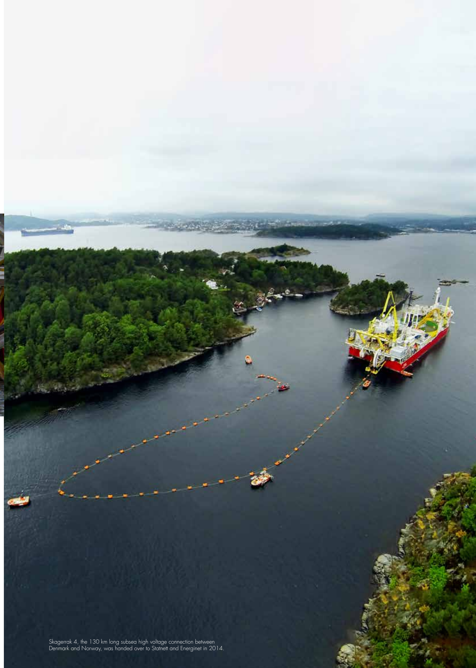
Skagerrak 4, the 130 km long subsea high voltage connection between Denmark and Norway, was handed over to Statnett and Energinet in 2014.

Strict requirements for reliability demands solutions that are based on long operating experience and extensive testing in the form of mechanical and electrical tests. We deliver complete solutions combining fiber and power in one cable.