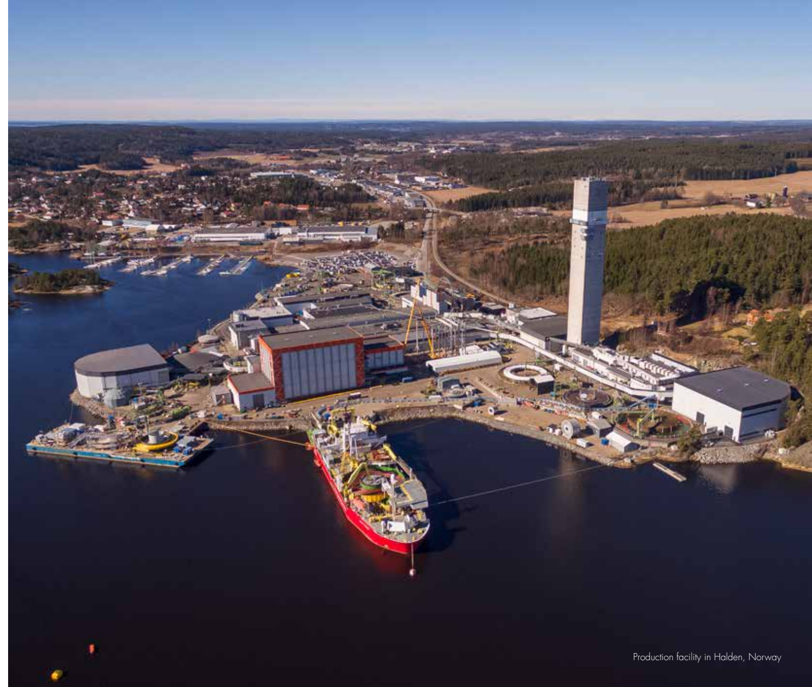
Production facility in Halden, Norway

Nippon High Voltage Cable Corporation in Japan was fully acquired by Nexans in 2017. The production facility, located in Futtsu, Japan, produces high voltage cables for submarine and land applications.